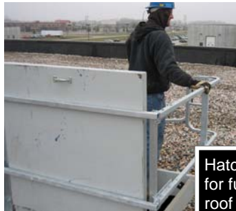
HatchSafe allows for full opening of roof hatch.