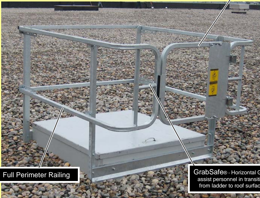
Full Perimeter Railing